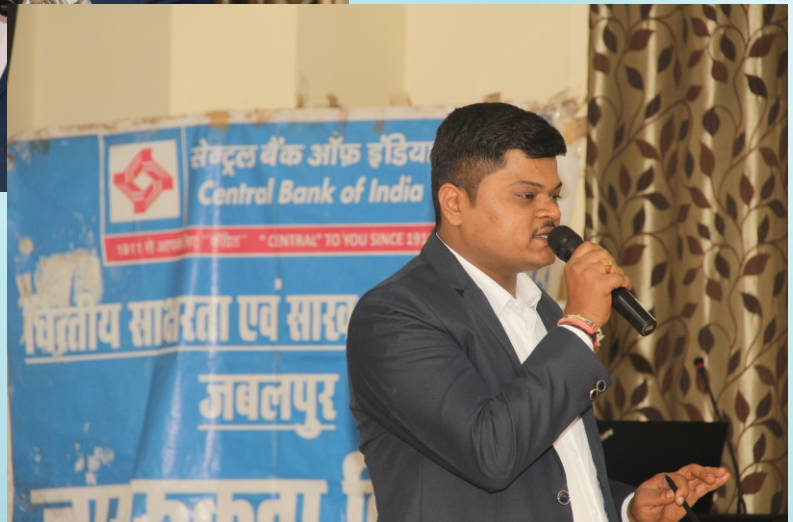
Delegates from Central Bank of India